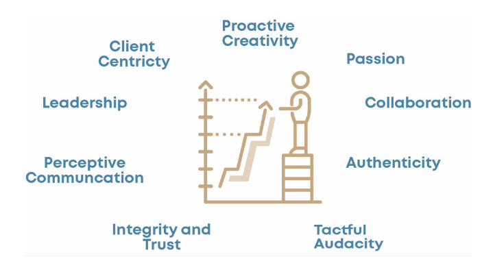
Figure Three: Commonly observed positive values

Of these values we considered what were required as 'base line point of entry' and what values, if any, would serve to differentiate one salesperson from another. For example, passion i.e. enthusiasm for one's company and products and solutions is something that matters to